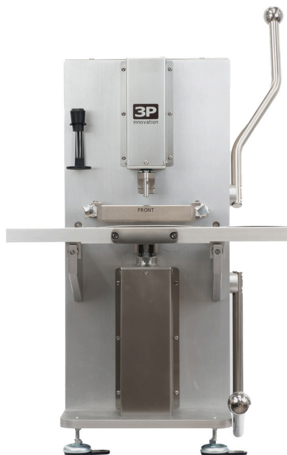
Compression Blister Filler Discover Range

With this in mind, the early stage unit uses two sets of die punches to lightly compress powder in a perforated plate to form soft, frangible, pellets and seal them within a blister strip. Designed for benchtop use and dry powder inhaler (DPI) applications, this equipment is used predominantly for R&D applications and directly mimics the Diskus/Ellipta filling process: it can be scaled-up for clinical/commercial use and total-lifecycle support. Plus, a suite of ancillary equipment can be supplied to suit blister devices such as forming, sealing, cutting and assembly fixtures.